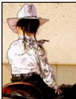
The Littlest Cowgirl

Bridle Path Tack & Craft Sale -- Saturday, October 6th, 2007 , 10 AM - 2 PM at the First Street Arenas. Whoa! Don't Miss the Conejo Valley Arabian Horse Association & Bridle Path Tack & Craft Sale. We have booths reserved for painted gourds, jewelry, photography, paintings, greeting cards, Christmas ornaments, hand-made crafts, show clothes, horse supplements, not to mention TACK and SO MUCH more! H.E.L.P. organization (handi-capped riders) has a sales booth and information area.